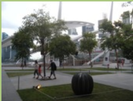
a view from Barrosa