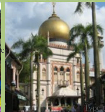
Kampong Glam "Arab Street"