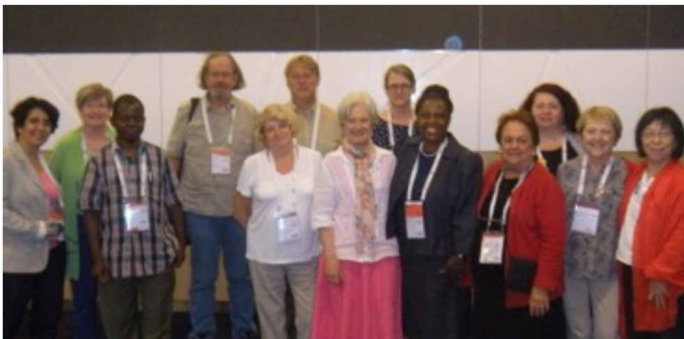
Standing committee members and guests after the Meeting 2 in Singapore.