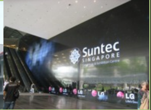
Suntec Convention Center