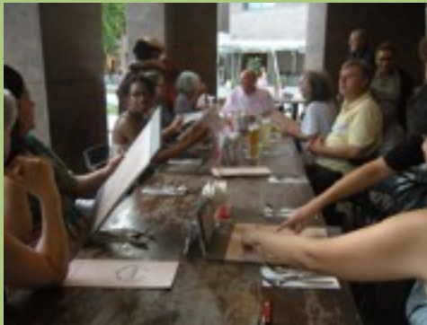
Social event at Barrosa