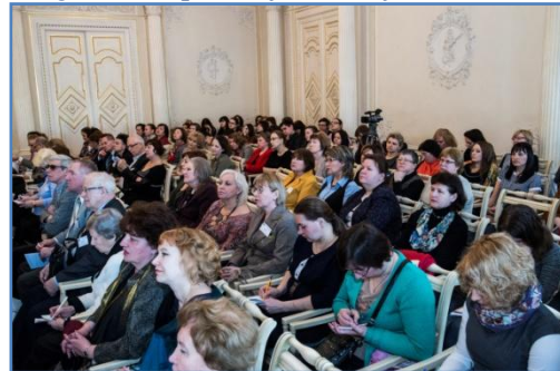
Image: Participants of the Conference