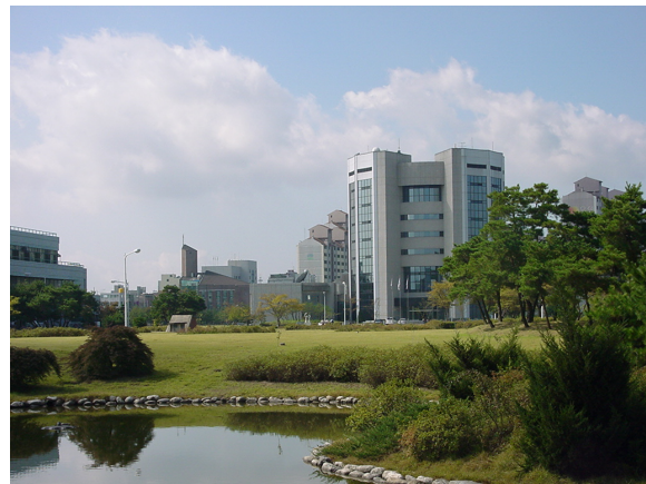
view of KISTI