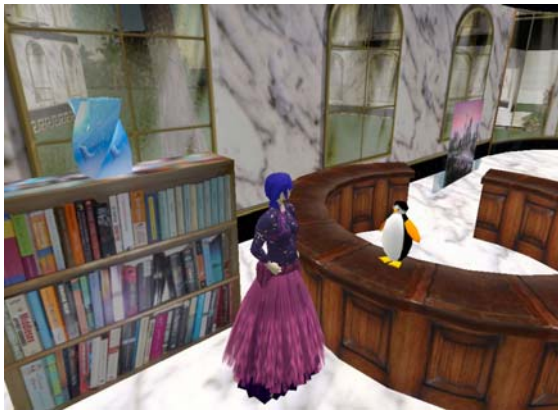
Inside the Australian library building