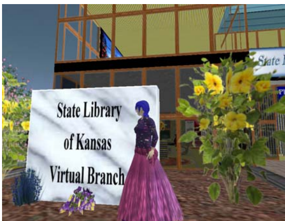
Outside Kansas State Library

Some people criticise SL for its commercial side, but I have found it useful in indulging my liking for virtual clothes for my avatar, and for buying items I do not yet know how to make, like coffee machines!