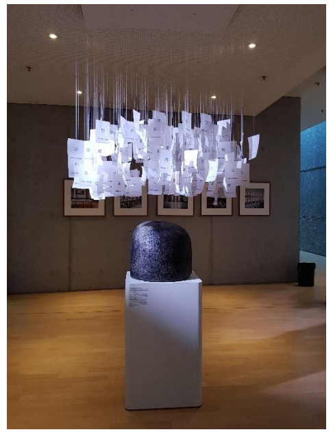
The Chinese Stonedrum in its GND cloud, credit: Barbara Fischer (own work) License: <u>CCO</u>

Now in December, we closed the first GND Convention with 300 participants, 40 sessions on topics from A as Authority Control to W as Wikidata involving contributors from many fields and the exhibition "See the GND".