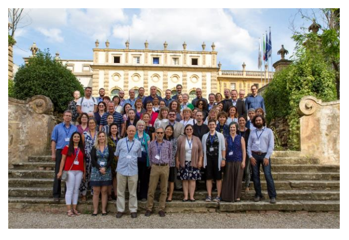
Participants of the European BIBFRAME Workshop 2018, Villa Salviati, European University Institute, Fiesole (Florence), Italy