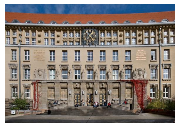
Entrance of the German National Library in Leipzig

Compiled by Elke Jost-Zell (Department of Subject Indexing)