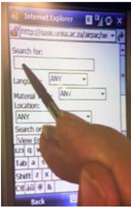
AirPAC being demonstrated