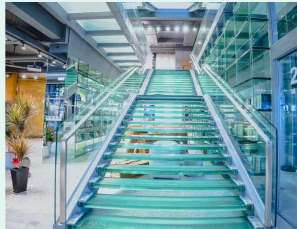
Glass Stairs which Marked with Big Events of Longgang City

The transformation of historic buildings can be seen as a way to protect city history. The "Water Tower" Library serves as a carrier of memorable heritage of the city by integrating the development history of Longgang city into the building. On the beautiful glass stairs in the library, every two of them are marked with big events promoting the development of this city. Therefore, each and every visitor to the library could have a general idea of the reform and development process and cultural spirit of Longgang.