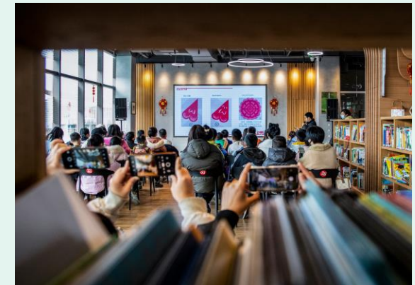
Reading Salon in "Water Tower" Library

The revitalization of abandoned buildings offers more than just resource conservation, it also serves as a catalyst for economic growth within the city. For instance, the "Water Tower" Library in Longgang has provided various job positions for the locals, including workers in the study and cultural activity planners, thereby driving the development of the local economy. By repurposing these transformed spaces, Longgang has created multifunctional areas for cultural, tourism, and commercial purposes, ultimately enriching urban life and enhancing the overall quality of the city.