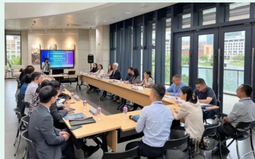
The Council Meeting 2023 of the Guangdong-Hong Kong-Macau University Library Alliance

The Council Meeting of the Library Alliance was held on 19 April 2023 in the University Gallery of UM. Academic libraries from the 3 regions reported on their recent, local collaboration projects and exchanged ideas for future development. Further cooperation was suggested by forming working groups on themes including training for young librarians, Chinese name authority related to the Guangdong area, and a library staff exchange programme.