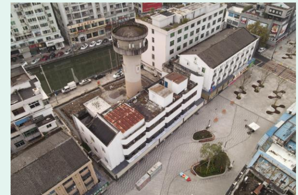
The Original Water Tower

The city's "Water Tower" Library is not merely a renovation of Longgang's old water factory. It is also an exemplary instance of repurposing abandoned buildings by revitalizing them and maximizing their environmental and sustainable potential.