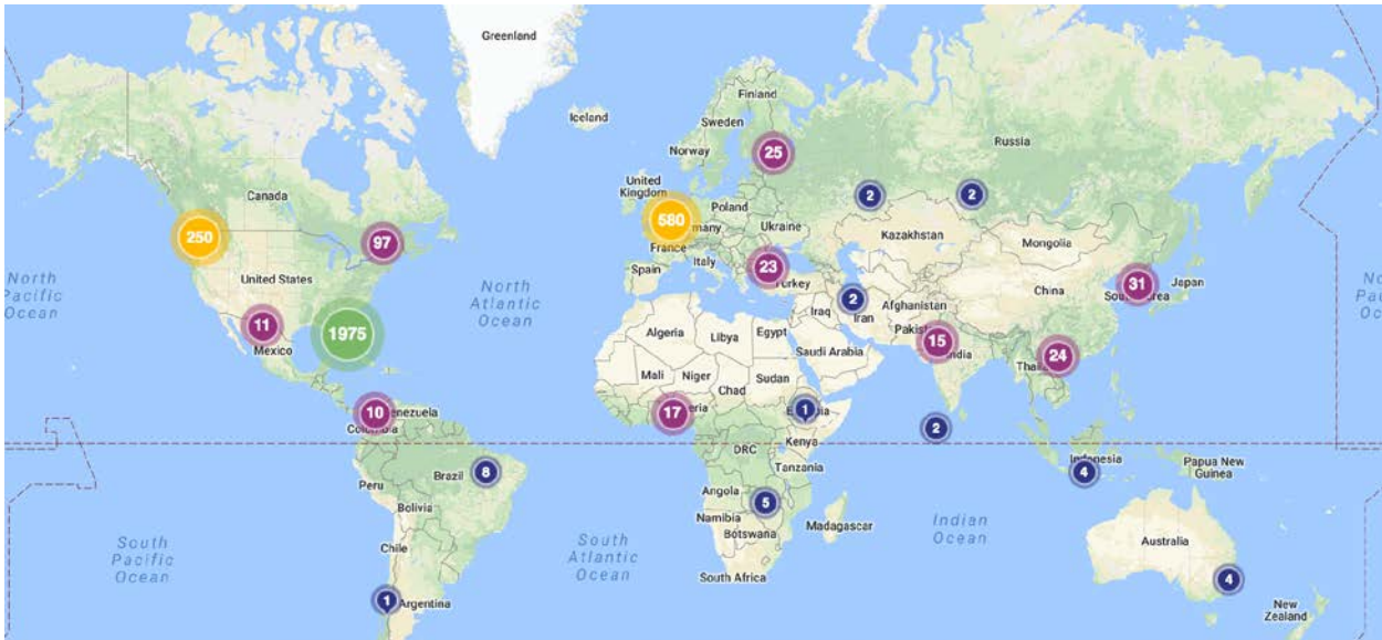
*Screenshot taken on April 5, 2018