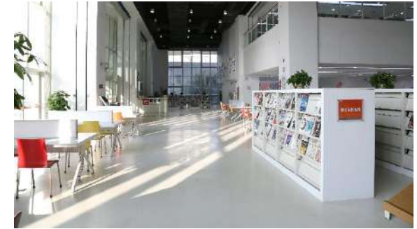
3000 sq.m. Self-service Library