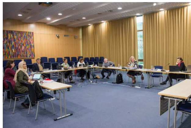
The PUC at Work, May 2019, IZUM, Maribor, Slovenia

The UNIMARC change proposals were discussed mostly in numerical order. Unless otherwise noted, the proposals were accepted or accepted as amended. In some cases, these actions represent final approval of previously accepted proposals that were subsequently found to need additional work.