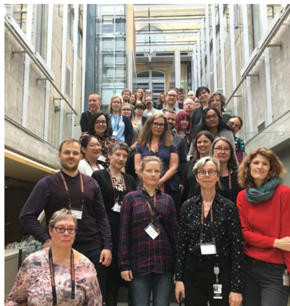
EDUG 2019