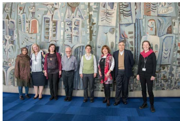
PUC Members at the 29th Meeting, May 2019, IZUM, Maribor, Slovenia

Planning for the online publication of the full text of U/B, including editing of the introduction and the appendices, continues and was further discussed in an editorial group conference call on 2019 May 29.