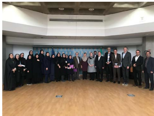
Attendees of the 5 th UNIMARC Users’ Group and 1 st Middle East Regional UNIMARC Users’ Group meetings, November 2018

On the 16 th and 17 th of November 2018, when the 4 th National Congress of Information Science Professionals was underway in Tehran, the National Library and Archives of Iran (NLAI) hosted the 5 th UNIMARC Users’ Group and 1 st Middle East Regional UNIMARC Users’ Group meetings.