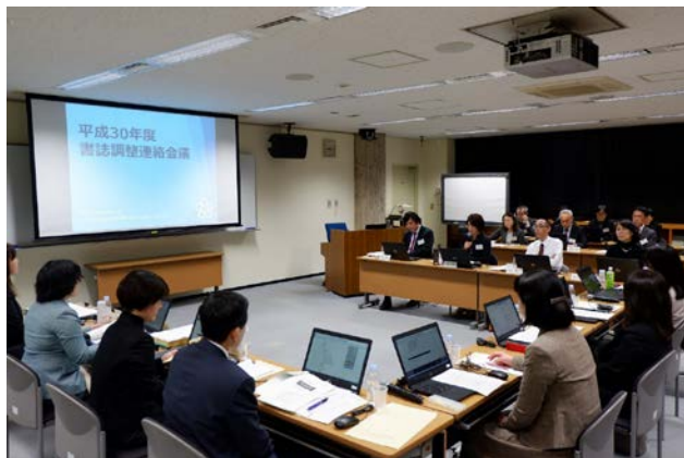
Annual Conference on Bibliographic Control

2021, the NDL plans to implement its own newly developed library cataloguing system.