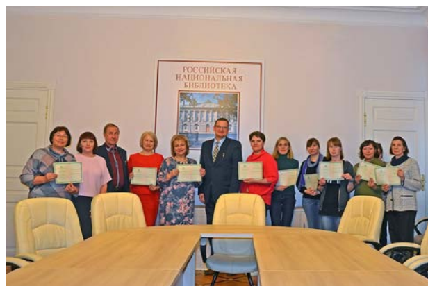
Workshop students on machine readable cataloging in RUSMARC format with advanced training diplomas

Communication on these issues has traditionally been carried out in the form of various “activities,” including conferences (both offline and online — for example, webinars) and organizing and conducting educational programs in the field of additional education. The seminar on machine-readable cataloging in the RUSMARC format, organized by the Processing and Catalogs Department of the National Library of Russia, which has been successfully held at the NLR Training Center for several years already, is a real example of the successful application of these “activities.”